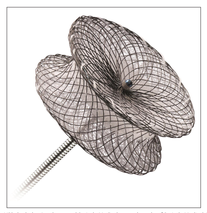
The Amplatzer Muscular VSD Occluder. Amplatzer and St. Jude Medical are trademarks of St. Jude Medical, Inc., or its related companies. Reprinted with permission of St. Jude Medical, © 2014. All rights reserved.