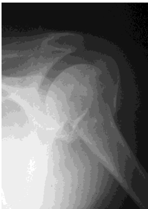
Fig. E-1A Anteroposterior radiograph of the shoulder, showing the proximal humeral fracture.