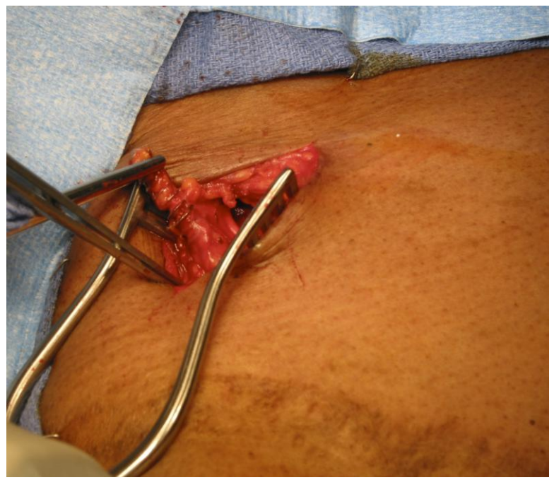
Fig. E-3B Figs. E-3A and E-3B Intraoperative removal of the supraclavicular screw.