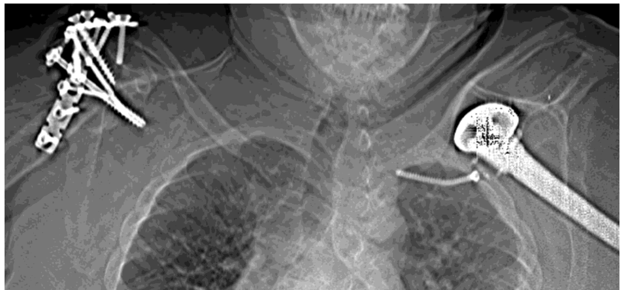
Fig. E-1 Premigration chest radiograph made in 2005.