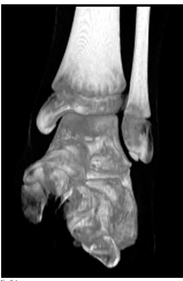
Fig. E-1 Three-dimensional CT scan showing a displaced os subfibulare. CT scans helped to characterize the local anatomy.

Copyright © by The Journal of Bone and Joint Surgery, Incorporated Pill et al Chronic Symptomatic Os Subfibulare in Children http://dx.doi.org/10.2106/JBJS.L.00847 Page 1 of 2