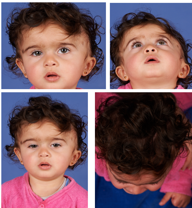
Supplemental Digital Content 3. Photos taken at 9 months' post-surgery; child aged 15 months old.