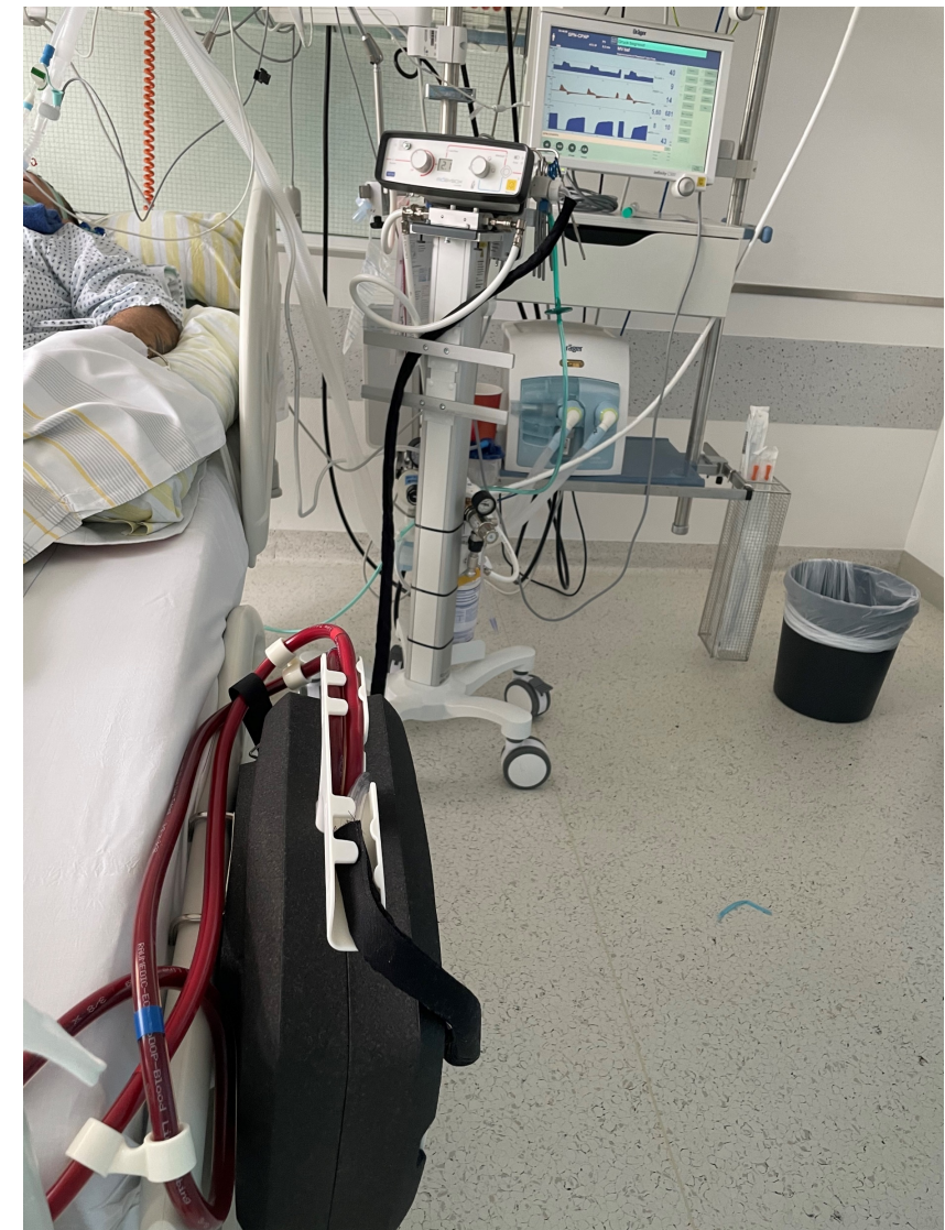
Supplemental Image 2. Moby Box Patient

Supplemental Images 1 & 2: MobyBox in action.