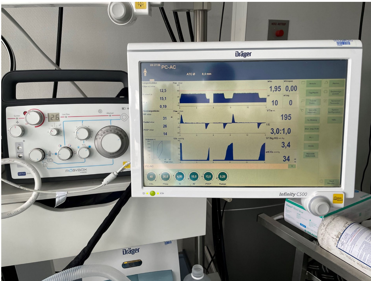
Supplemental Image 1. Moby Box Controller