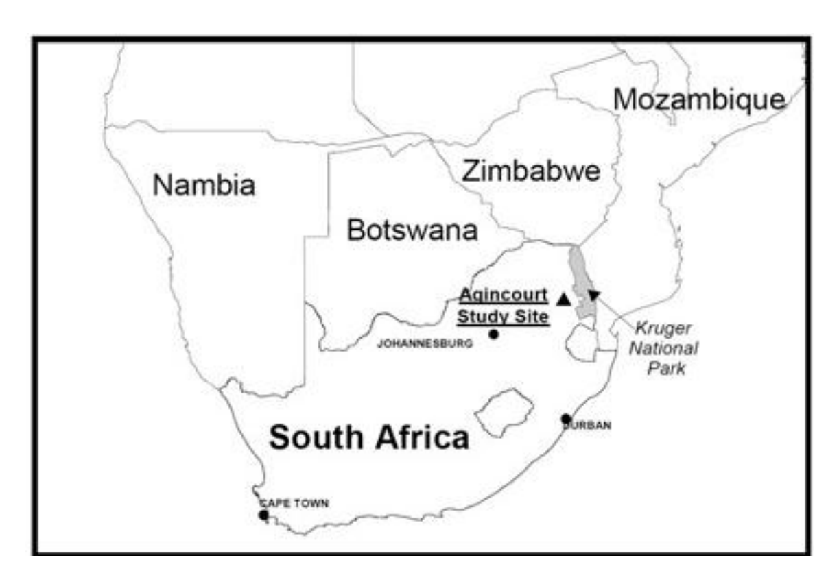
Fig 1a: Location of Agincourt field site